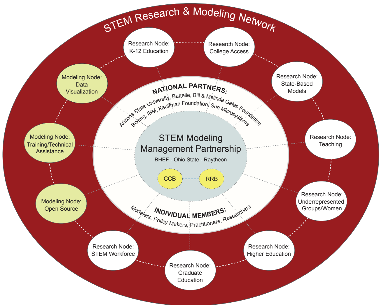
Figure 3: Proposed Structure of SRMN

the SRMN, i.e. organizations and individuals that are actively supporting the model and fostering innovation and research within the network. The research and modeling nodes in the graphic below are merely to suggest the types of sub-groups that may emerge.